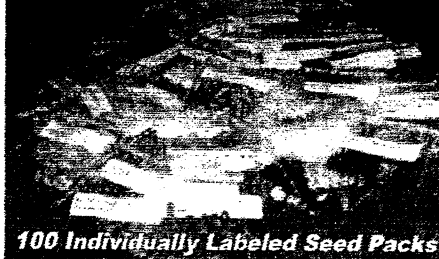
100 Individually Labeled Seed Packs

Your Order Will Include Most All Varieties Of Common Vegetables With A Few Rare Varieties + Herbs Thrown In.